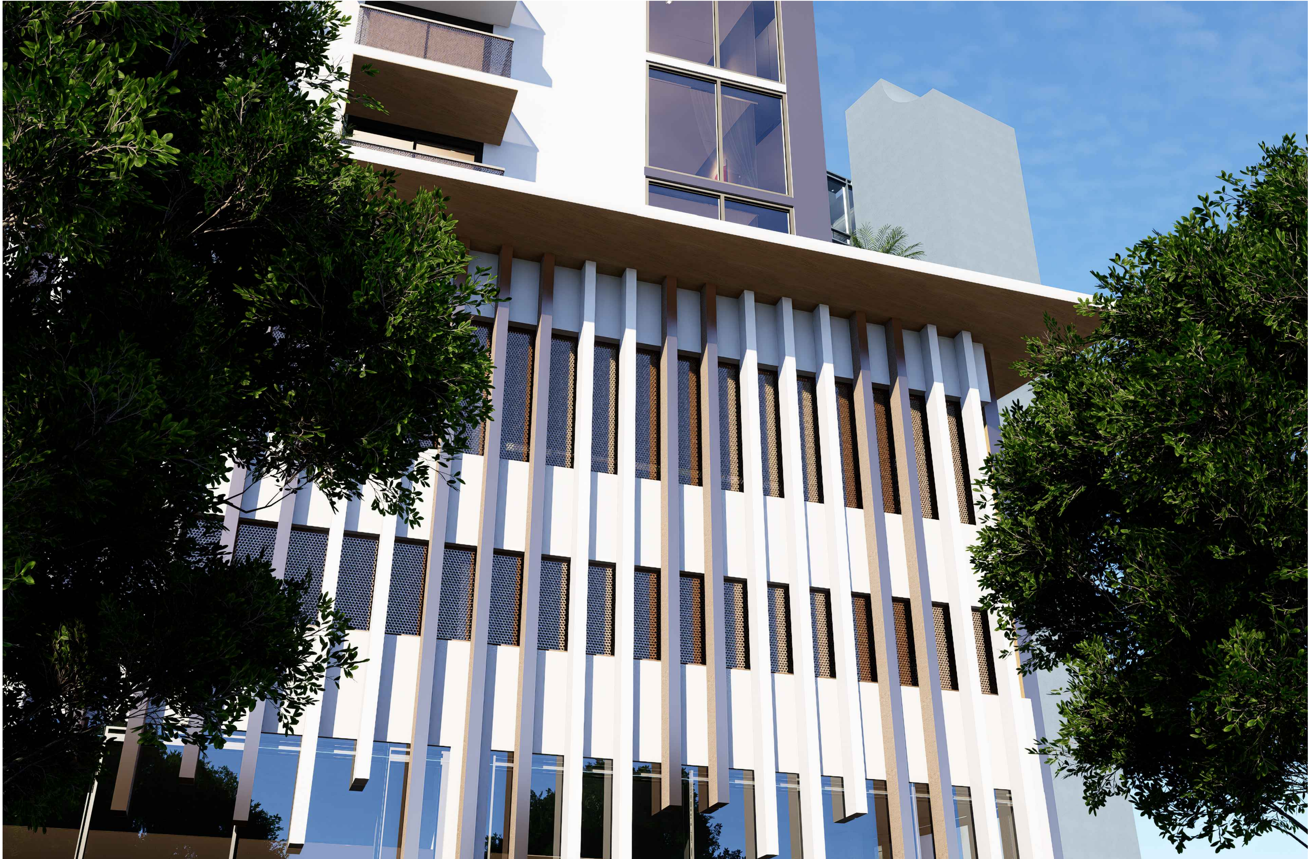
ZOOM-IN VIEW OF THE PARKING GARAGE SCREENING